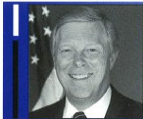
Hon. Richard Gephardt Former Democratic Majority & Minority Leader of the U.S. House of Representatives

Hon. Richard Gephardt, Former Democratic Majority and Minority Leader, has been unanimously elected to the Labor Advisory Board.